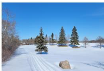
Trail system 1 Rossman Lake Resort