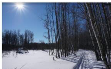
Trail System 2 9 Finger Ranch